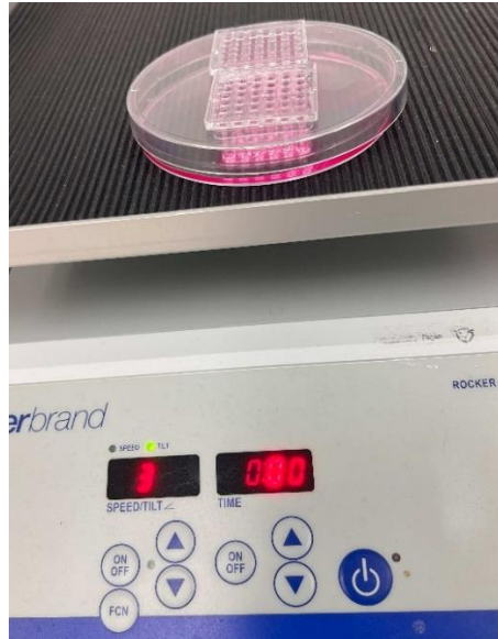
Figure 2. Dynamic cell culture on the 36PillarPlate in a petri dish by rocking the cell culture medium on a low-speed rocker.