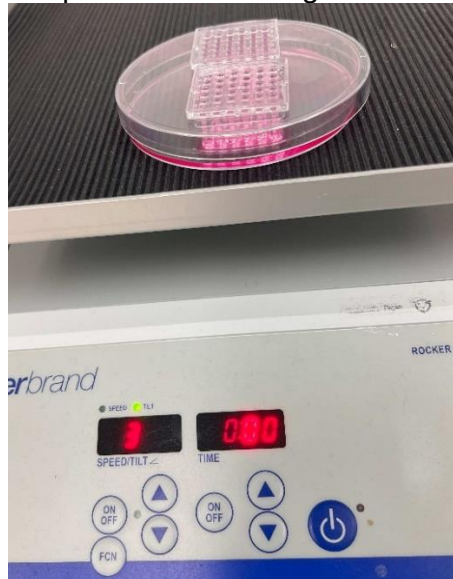
Figure 2. Dynamic cell culture on the 36PillarPlate in a petri dish by rocking the cell culture medium on a low-speed rocker.